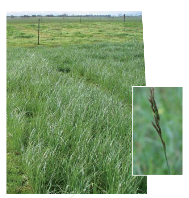
Winter-active tall fescue and tall fescue seedhead [inset]