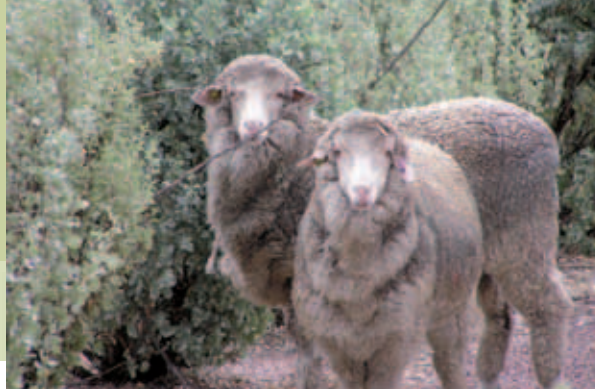
The shrubs have transformed a previously unproductive paddock, prone to wind erosion, into a stable and productive grazing area.

With this in mind, the forage shrubs were established as hedgerow windbreaks, aligned north to south, with 4.5 metre spacing between the rows.