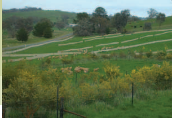
The benefit from shelter varies depending on the environment. A 0-10% increase twin lamb survival was achieved using shrubs in the milder conditions at Wagga Wagga EverGraze research site.