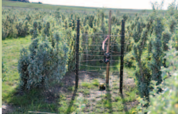
Anemometers were placed among the saltbush hedgerows on the trial site, to measure and record wind speed at 10-minute intervals.

While high wind-chill periods are uncommon during winter and spring in East Gippsland (unlike areas such as Hamilton), extreme events do occur. According to Rick, these result in heavy stock losses, particularly twin-born lambs and bare-shorn sheep.