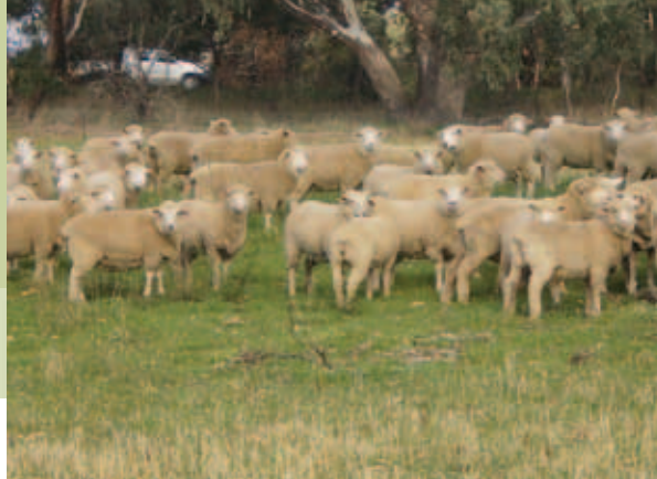
The phalaris pasture, shown here in autumn 2011, carried an average of over 19 DSE/ha during 2010, 2011 and 2012. Rod used it in conjunction with the lucerne to carry the crossbred lambs to heavier weights.

In addition to the same pre-sowing sprays and fertiliser at sowing as the phalaris paddock, the lucerne received phosphorus