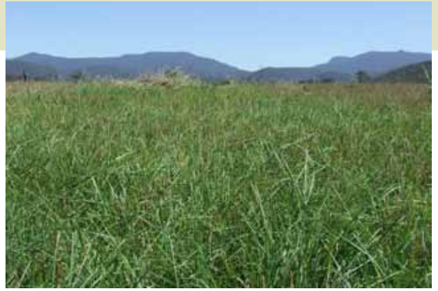
March 2010, Uplands response to summer rain at Speyside - tonnes of feed!

“The cocksfoot ‘Uplands’ has proven to be a success in my situation”.